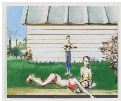
Verne Dawson, The New Road, 2017