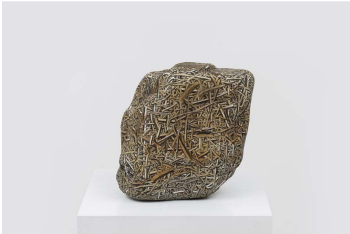
Cornerstone No.1 | acrylic on stone, carving | 32 x 22 x 36 cm | 2018

Hadrien de Montferrand Gallery is pleased to present "Cornerstone", a solo exhibition of Hao Shiming. The show will open on January 20th and last until March 3rd 2018. This is the second solo exhibition of the artist with the gallery. The exhibition will showcase the artist's latest works painted on stones and the paper series "Da Guan".